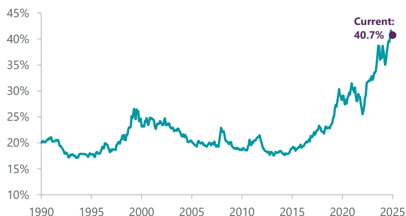
Exhibit 2: Weight of Top 10 Stocks in S&amp;P 500

As of Dec. 31, 2025.