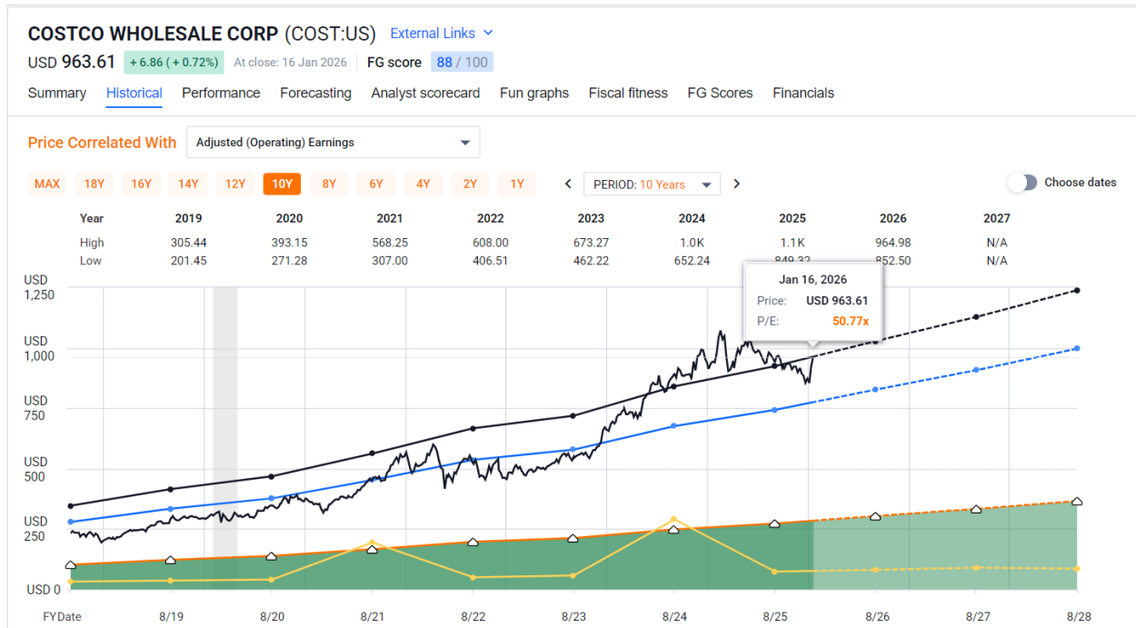
Figure 1: COST Blended Forward P/E Multiple