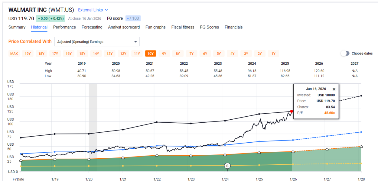
Figure 2: WMT Blended Forward P/E Multiple