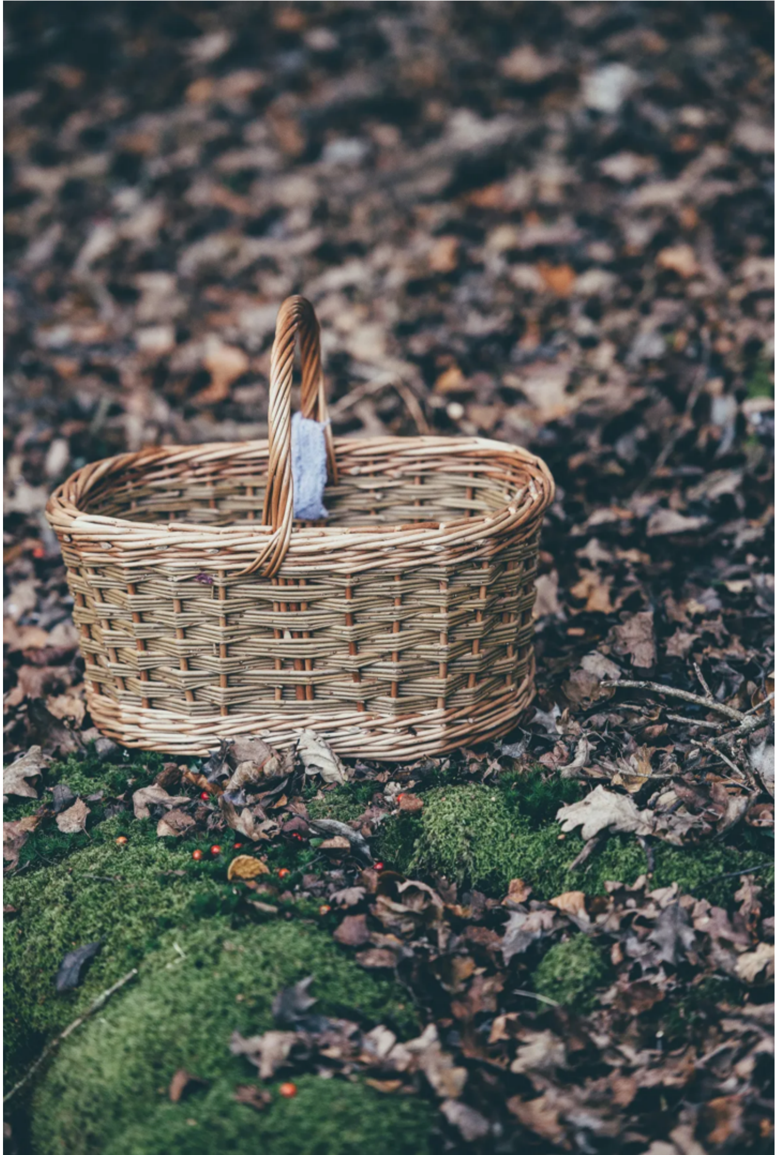
A Basket, symbolic of the market's trending in our Q2 portfolio review

Here are a few baskets, and which stocks of ours are included. Some of them qualify for multiple baskets, as we'll see.