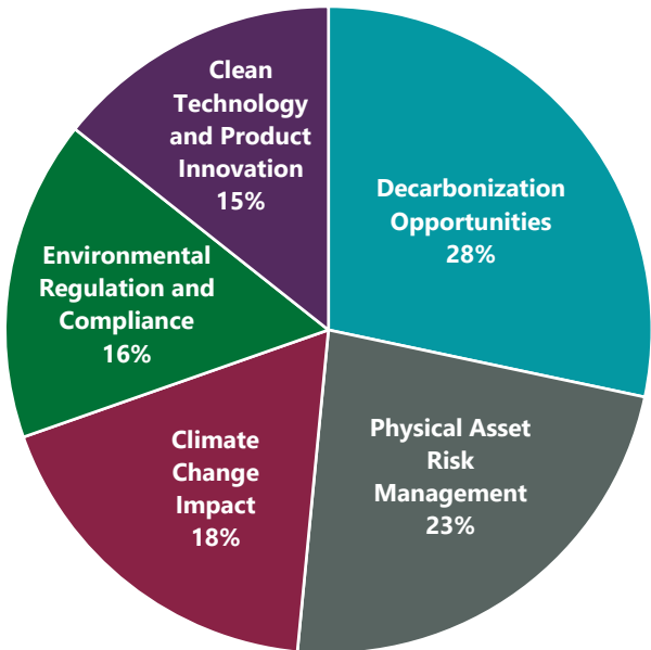
Exhibit 2: Top Environmental Factors Engaged Upon in 2024

As of Dec. 31, 2024.