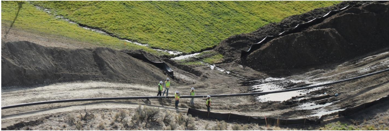
Figure 1: Pipeline construction at SWX's Great Basin Gas Transmission Company